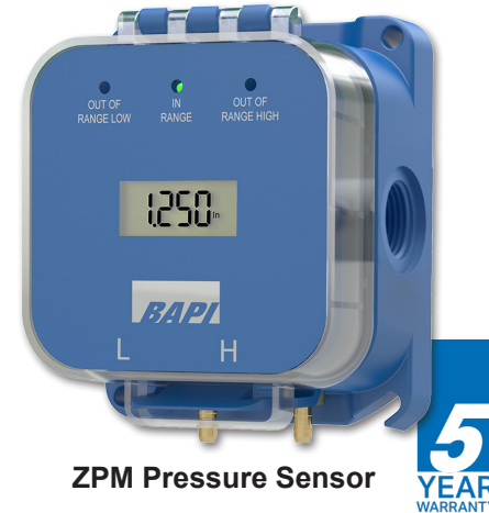
ZPM Pressure Sensor

Ranges and Outputs Can Be Set Easily Without Powering the Unit. Just Open the Hinged Cover.