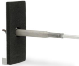
Rigid Probe – Bracket Mount